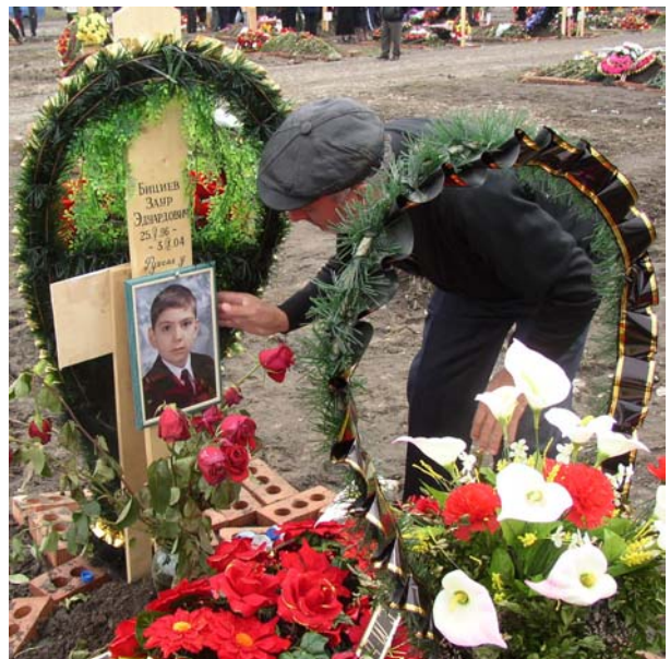
Grandfather grieve over his grandson

Soon I could hear some voices. A woman lying close to us with her 12 year old daughter told us the most amazing news, “Stand up. It is all over. The soldiers are ours”. I opened my eyes slightly and saw a man attired in a uniform, holding a submachine gun. “Who are you?” I asked distrustfully. “We are your rescuers. You are free.” I was fully aware that someone’s shed blood saved our lives.”