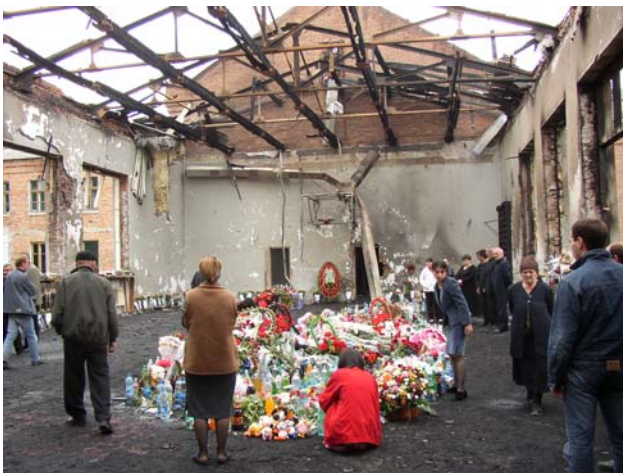
The gym where hostages were kept

On September 1, the morning of the first day of school, a group of around thirty armed men and women stormed Beslan’s Middle School Number One, whose pupils are aged from seven to eighteen years old. After an exchange of gunfire with police, in which five officers were killed, the attackers seized the school building, taking 1181 people hostage, most under the age of eighteen.